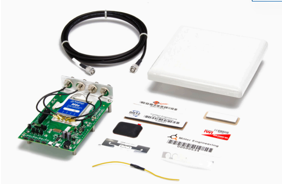
M6e Reader DevKit shown